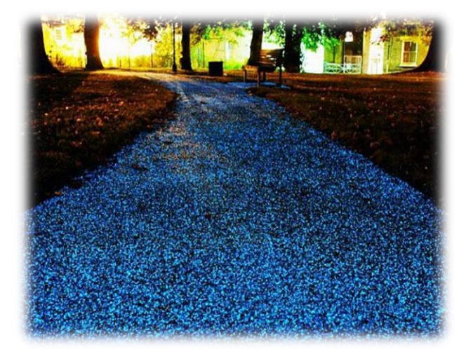
Figure 20 Iridescent pathway