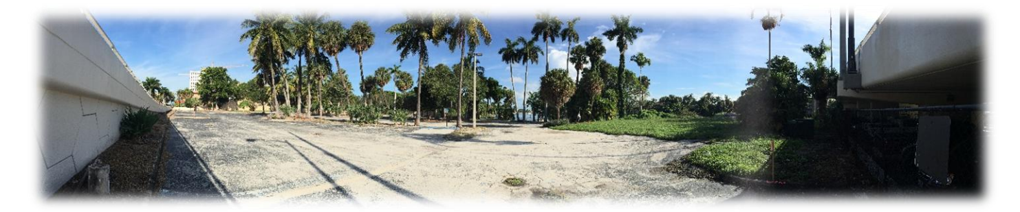
Figure 4 Panorama of The Wildflower as it is today

The property now sits vacant as the iconic Wildflower nightclub was razed several years ago.