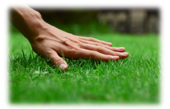
Figure 24 Comfortable and Safe Grass