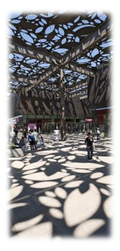
Figure 11 Semi sheltered shade