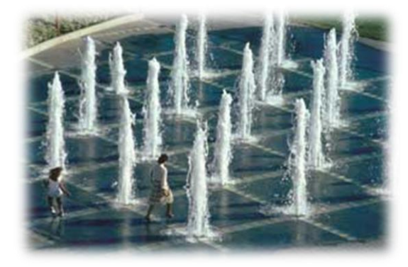
Figure 18 Dry Deck Fountain