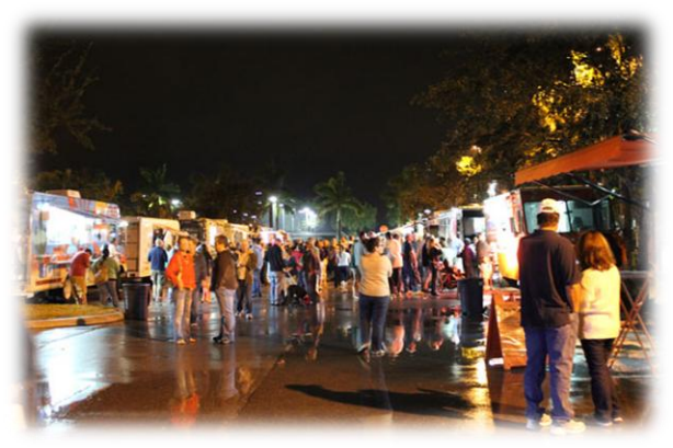
Figure 9 Food Truck Concept with al fresco Dining