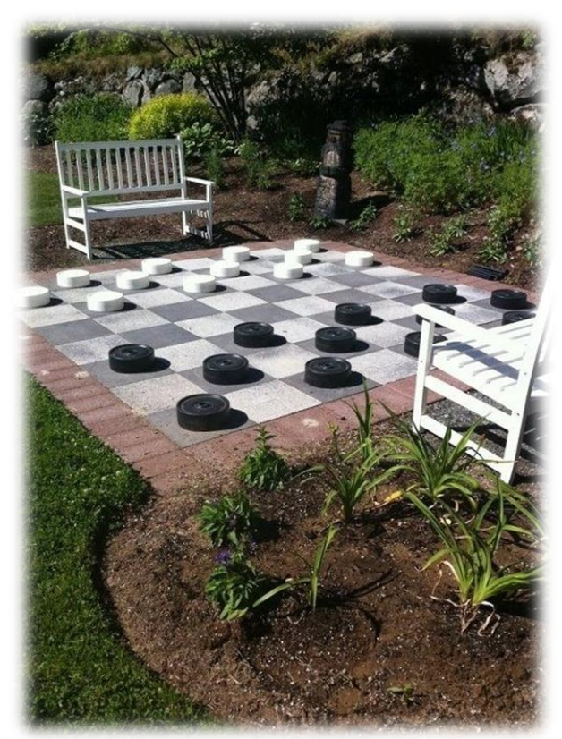
Figure 12 Participatory public art