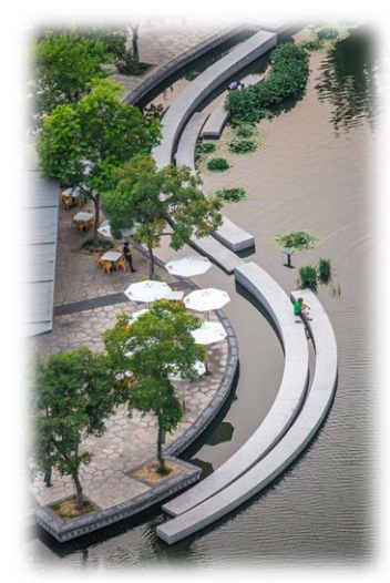
Figure 6 Dock Design Inspiration

(See corresponding numbers on the Proposed Site Plan)