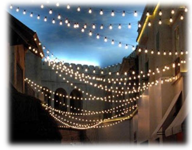
Figure 21 String lights for under the Palmetto Park Road Bridge