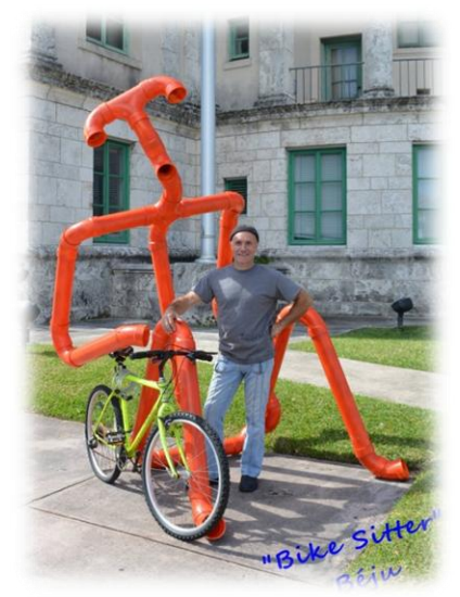
Figure 22 Example of Public Art / Bicycle Rack