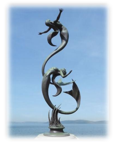
Figure 7 Public Art