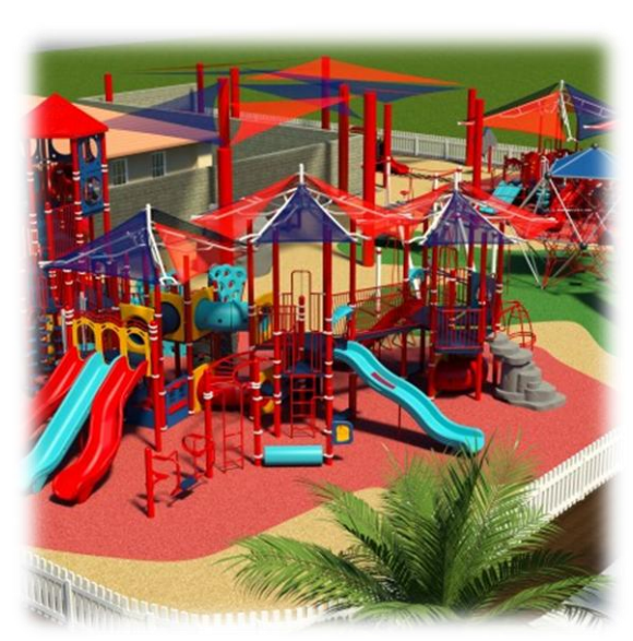
Figure 13 Playground