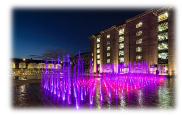
Figure 17 Dry Deck Fountain