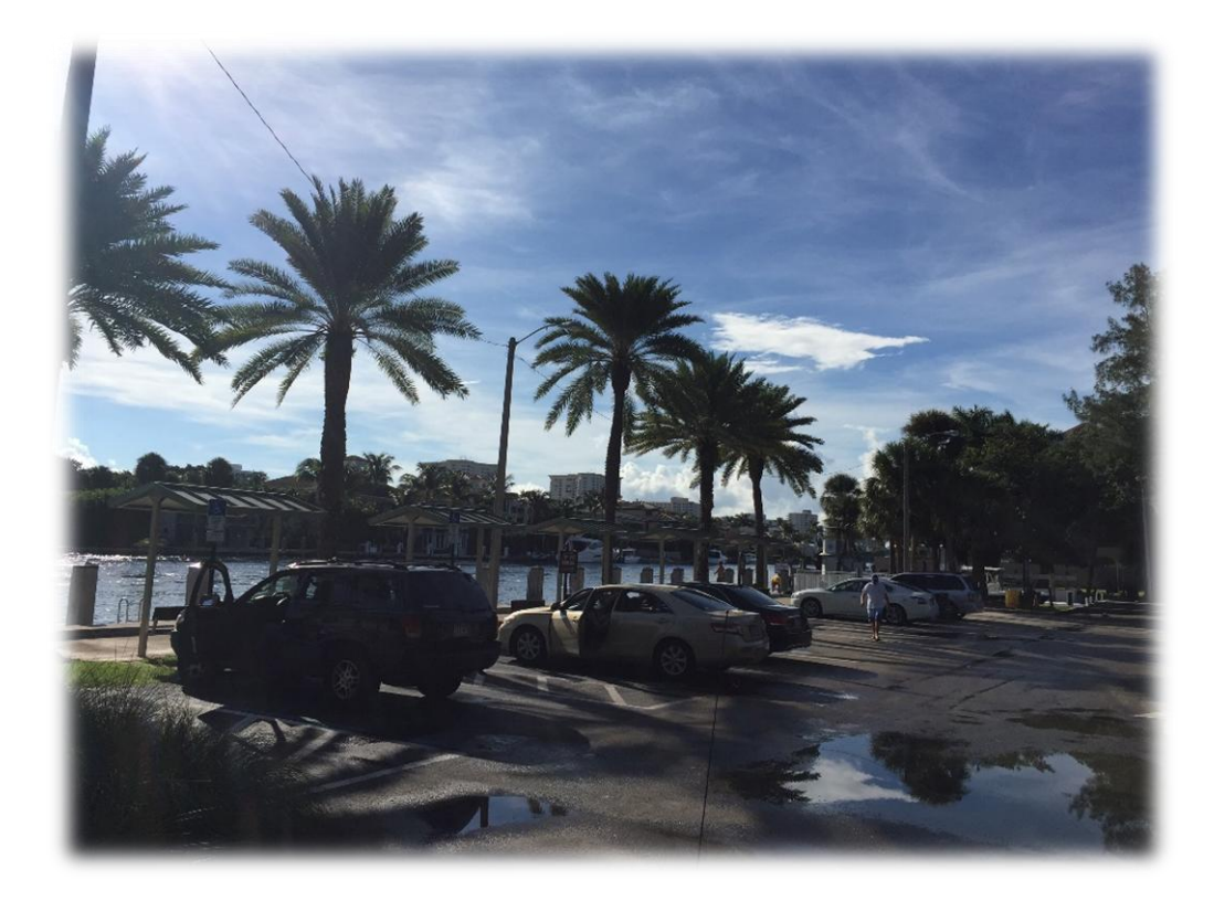
Figure 3 Docks, Boat Ramp