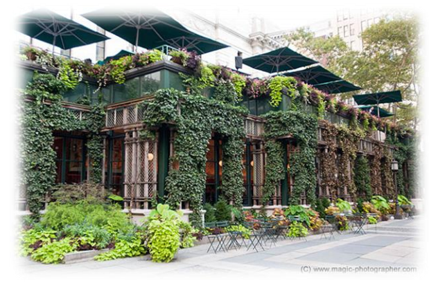
Figure 8 Bistro Concept with al fresco Dining