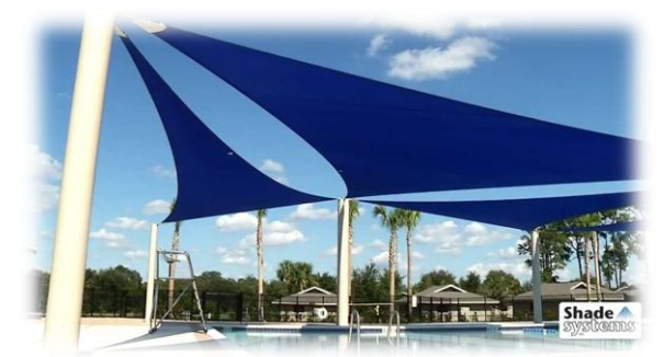
Figure 16 Waterside shade