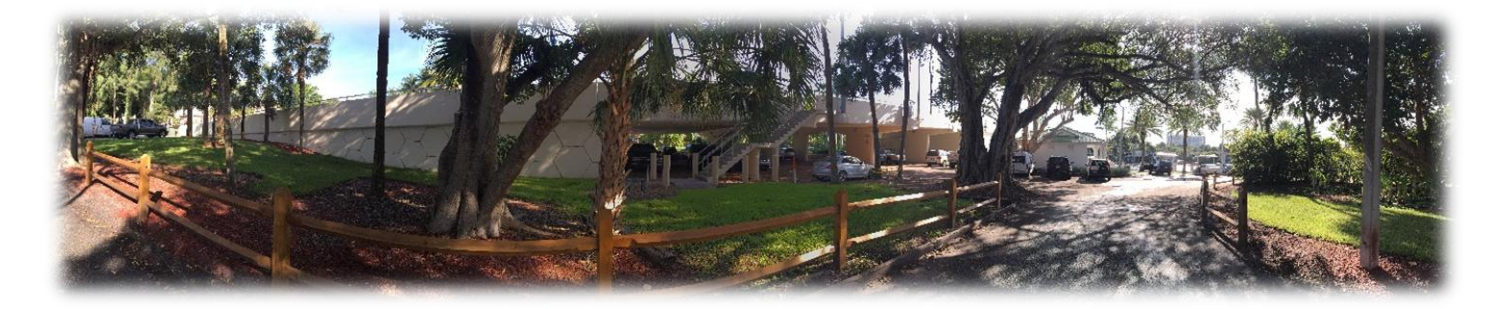
Figure 1 Panorama of the Palmetto Park Road Bridge