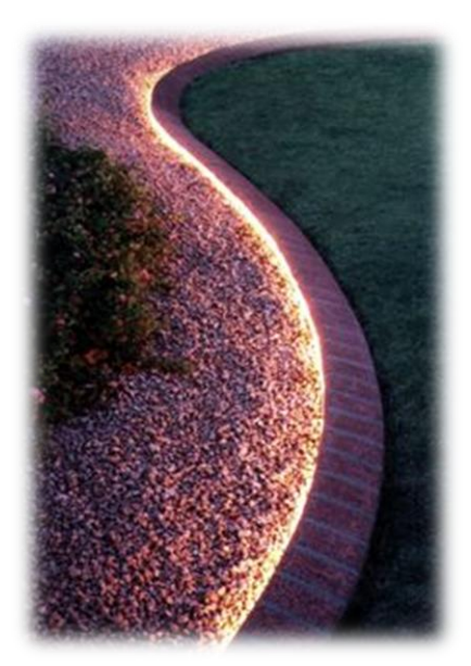
Figure 19 Pathway lighting