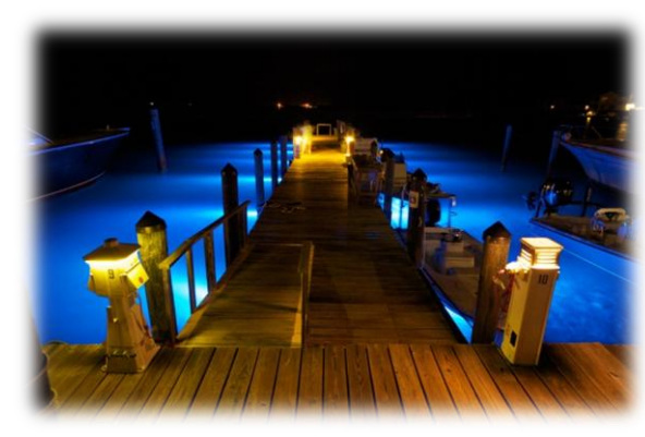
Figure 23 Dockside Underwater Lighting