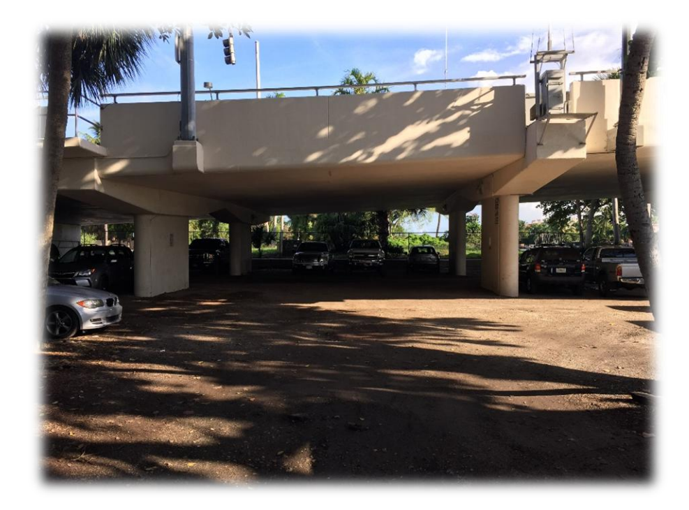
Figure 2 Under bridge linkage from Silver Palm Park to The Wildflower